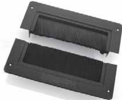
Split Integral Raised Floor Grommet Item No. 3030