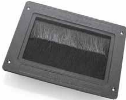
Integral Raised Floor Grommet Item No. 1010